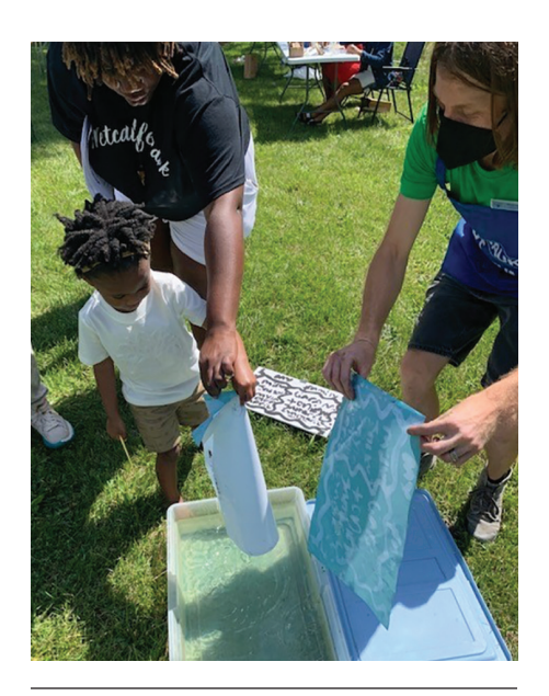
Outdoor art making at Metcalfe Park Rising