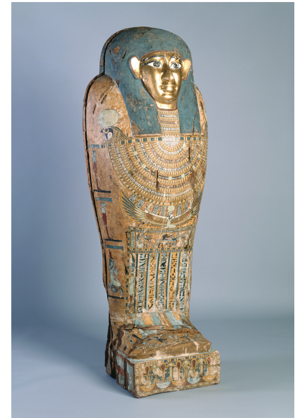
ABOVE Mummy Coffin of Pedusiri, Late Dynastic (712–323 BC) or Early Greco-Roman (323 BC–AD 395) Period, 500/250 BC. Purchase, M1967.20.

Sponsored by: Milwaukee Art Museum’s Fine Arts Society