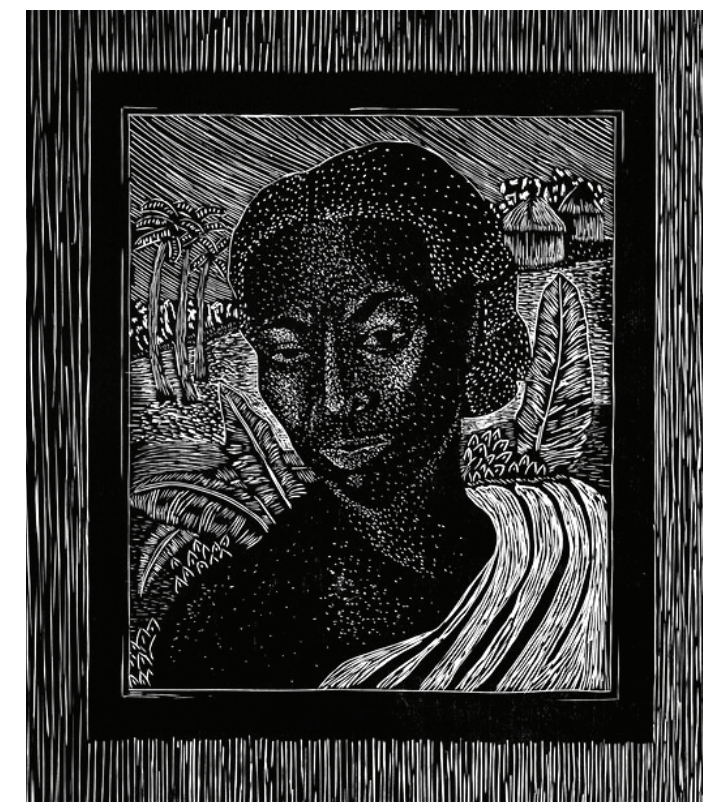
Margaret Taylor Burroughs American, 1915–2010 Mother Africa , n.d. Linocut