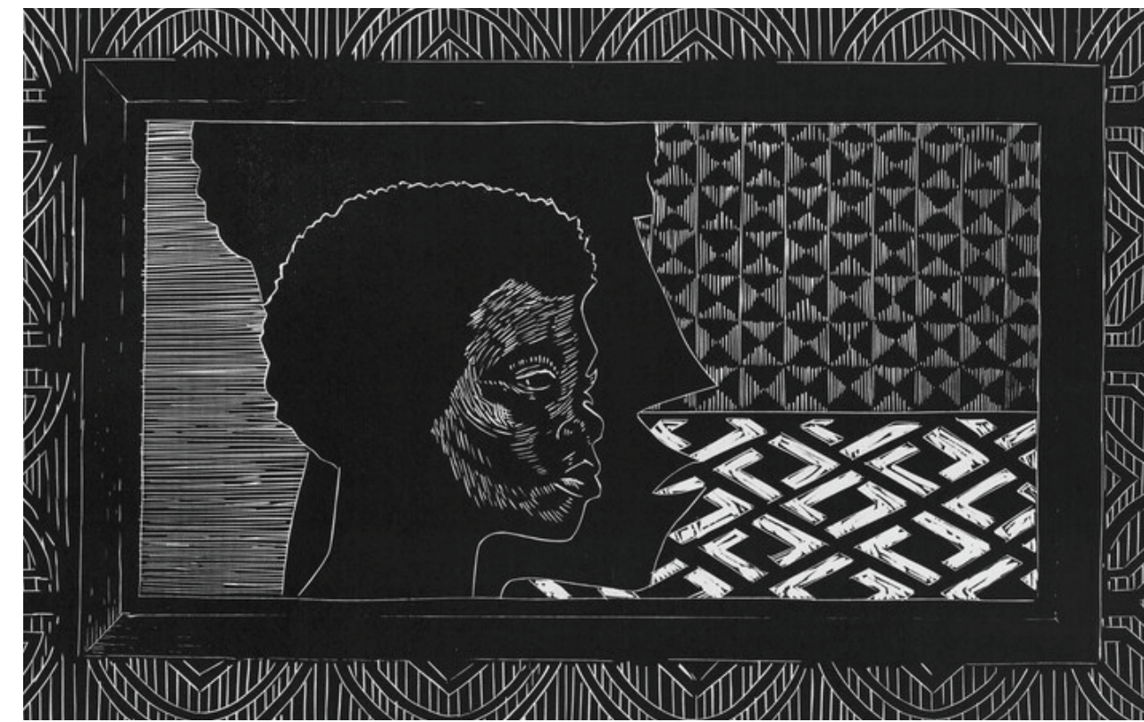
Elizabeth Catlett American, active in Mexico, 1915–2012 Roots , 1981 Screenprint