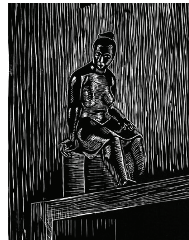
Elizabeth Catlett American, active in Mexico, 1915–2012 Seated Woman , 1962 Mahogany