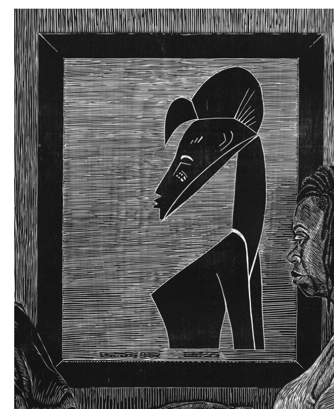
Valerie Maynard American, 1937–2022 Senoufo , 1981 Screenprint