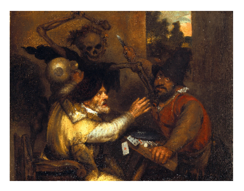
FIG. 8. Fighting Cardplayers and Death, c. 1638, oil on canvas on panel. Private collection

"Everything his young spirit endeavors to capture must be magnificent and lofty. Rather than depicting his subject in its true size, he chooses a larger scale." CONSTANTIJN HUYGENS, 1629–1631