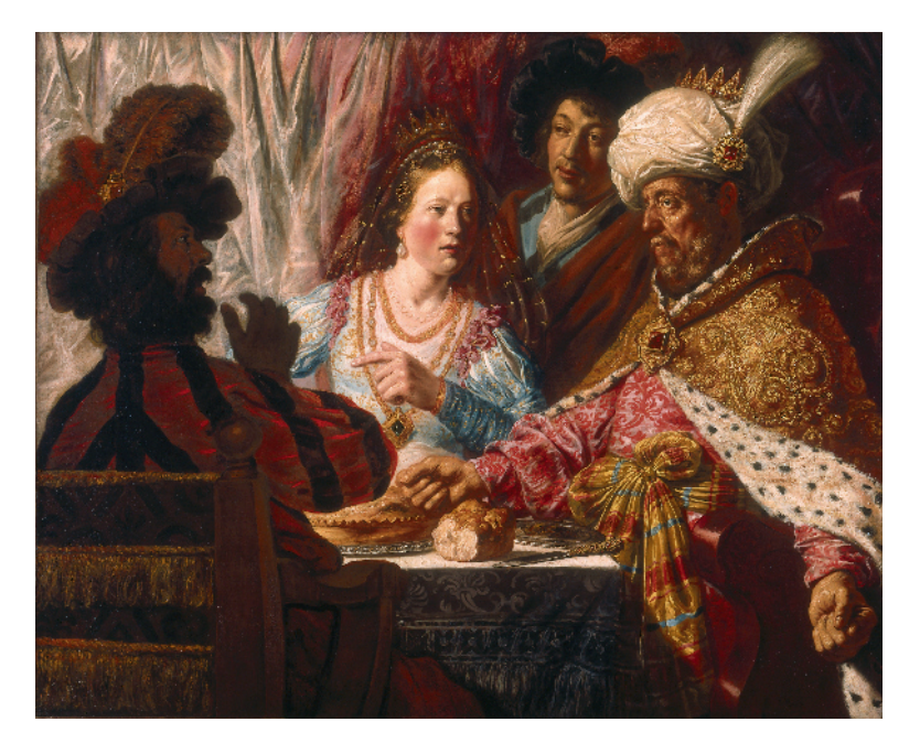
FIG. 1. The Feast of Esther, c. 1625, oil on canvas. North Carolina Museum of Art, Raleigh, Purchased with Funds from the State of North Carolina

Orlers described Lievens as an industrious painter from whom great things were expected. Lievens' own belief in his potential is clear from the exceptional range of subjects he chose throughout his career: portraiture, still life, landscape, depictions of everyday life, and — most important for establishing his reputation — grandiose allegorical scenes and biblical narratives, such as The Feast of Esther , c. 1625 (FIG. 1). Completed when the artist was not yet twenty, the painting depicts the moment from the biblical book of Esther (7:4–10) when the queen reveals to her husband, the Persian king Ahasuerus, the plot to destroy all the Jews in the kingdom, including herself. In Lievens' dramatic scene, Esther points to the shadowed figure of the conspirator — the court favorite, Haman — who draws back in terror as Ahasuerus glares at him with clenched fists moments before ordering his death.