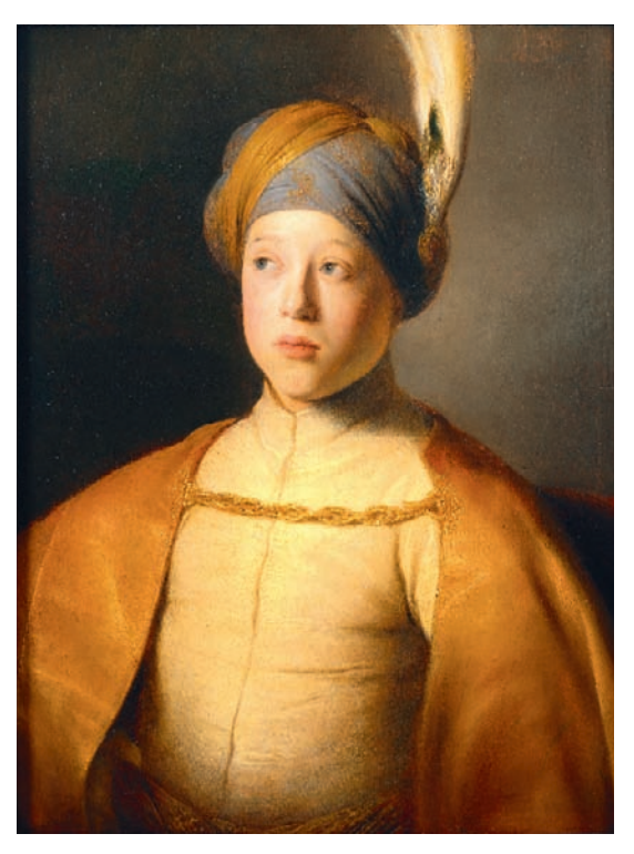
FIG. 3. Boy in a Cape and Turban, c. 1631, oil on panel. Private collection

lectuals, is one clue that the sitter is a character type rather than an individual.