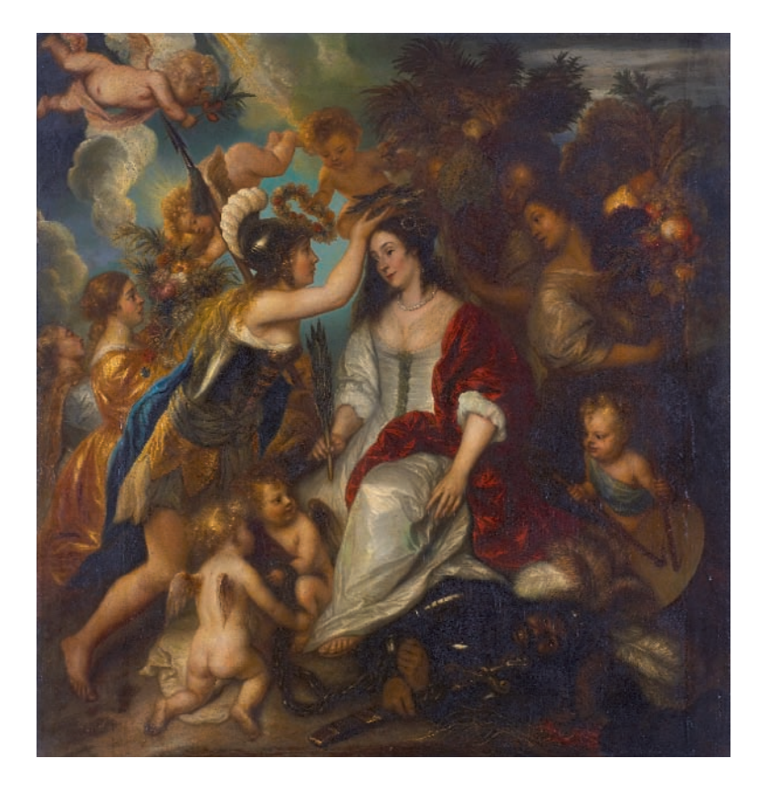
FIG. 10. Triumph of Peace, 1652, oil on canvas. Rijksmuseum, Amsterdam

Demand for Lievens' portrait drawings and paintings was high in Amsterdam. His reputation ensured an impressive list of distinguished sitters, both local and international, such as the French philosopher René Descartes and Sir Robert Kerr, First Earl of Ancram. The likeness of Kerr, from 1654 (FIG. 11), is an affecting depiction of a once powerful man reduced to poverty and exile at the end of his life. Loyal to Charles I, the earl had fled England upon the king's beheading in 1649, living his few remaining years in Amsterdam. Lievens brilliantly captured the mixture of regret and determination in Kerr's frail face. The dark tonality points to the artist's continued assimilation of local painting traditions, as he tempered the grandeur of the international style he had cultivated to accommodate the preference