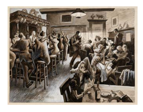
Thomas Hart Benton Thursday Night at the Cock-and-Bull. It's the Maid's Night Out, 1937 Ink, watercolor, gouache, and graphite on paper 12\ 5/8 \times 16\ 3/4 in. (32.1 \times 42.5\ cm) Private collection