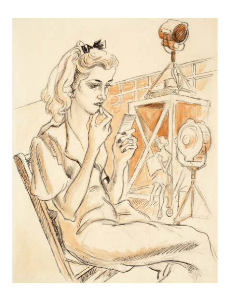
Thomas Hart Benton Member of the Chorus, 1937 Ink, ink wash, and graphite on paper 13\ 3/4 \times 10\ 3/8 in. (34.9 × 26.4 cm) Private collection