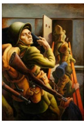
Thomas Hart Benton Shipping Out, 1942 Oil on canvas 40\times28\ 1/\ 2\ \text{in.}\ (101.6\times72.4\ \text{cm}) Private Collection