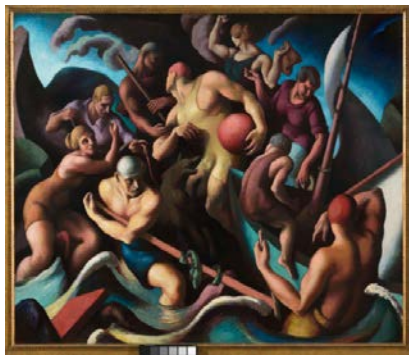
Thomas Hart Benton People of Chilmark (Figure Composition), 1920 Oil on canvas 65.5/8 \times 77.5/8 in. ( 166.5 \times 197.3 cm) Hirshhorn Museum and Sculpture Garden, Smithsonian Institution, Washington Gift of the Joseph H. Hirshhorn Foundation, 1966, 66.468

The Nelson-Atkins Museum of Art, Kansas City, Missouri, Bequest of the Artist, F75-21/10