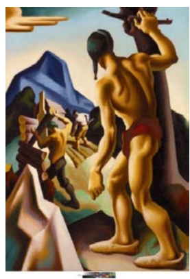
Thomas Hart Benton The Lost Hunting Ground, 1927–28 From the mural series American Historical Epic, 1920–28 Oil on canvas 60\ 1/4 \times 42\ 1/8 in. (153 \times 107\ cm)

The Nelson-Atkins Museum of Art, Kansas City, Missouri, Bequest of the Artist, F75-21/10