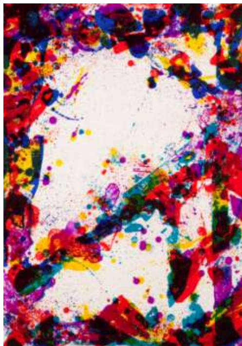
Sam Francis, Chinese Opal, 1970. Milwaukee Art Museum, gift of the Sam Francis Foundation, California. M2009.138.