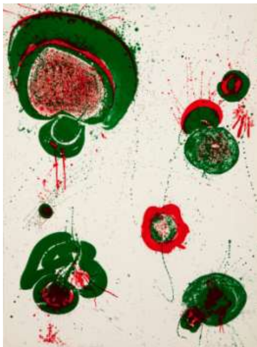
Sam Francis, Chinese Planet , 1963. Milwaukee Art Museum, gift of the Sam Francis Foundation, California M2009.190. © Sam Francis Foundation, California / Artists Rights Society (ARS), New York.

To download high-resolution versions, please visit http://mam.org/info/pressroom/ and register. Images are for media use only.