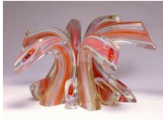
Harvey K. Littleton (American, 1922–2013) Lemon/Red Crown , 1989 Blown and drawn glass, cut and polished 15 3/4 × 28 1/4 × 31 in. Milwaukee Art Museum, Gift, M1990.5 © Harvey K. Littleton