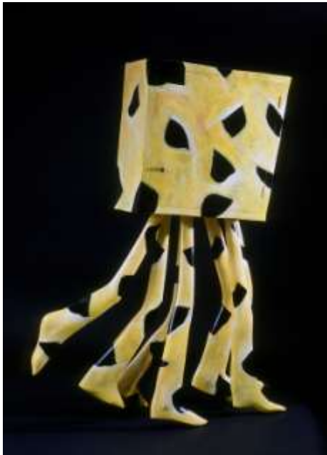
Wendell Keith Castle (American, b. 1932) Walking Cabinet , 1988 Painted wood, cast aluminum, and mappa burl veneer 60 × 50 × 18 in. Milwaukee Art Museum, gift of Karen Johnson Boyd M1989.112