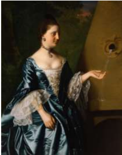
John Singleton Copley (American, 1738–1815) Alice Hooper , ca. 1763 Oil on canvas 50 × 40 in. Milwaukee Art Museum, purchase, M2011.15