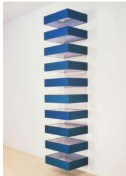
Donald Judd (American, 1928–1994) Untitled , 1981 Anodized aluminum and Plexiglas installed: 180 × 40 1/8 × 31 in. Milwaukee Art Museum, gift of Tony and Sue Krausen M1998.127a-j