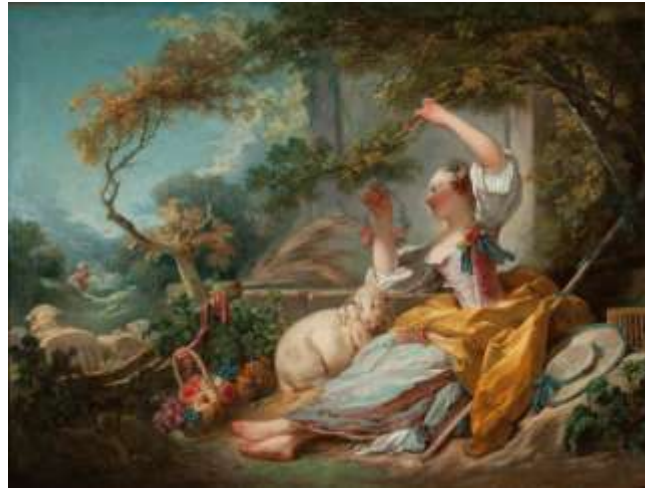
Jean-Honoré Fragonard (French, 1732–1806) The Shepherdess , ca. 1750/52 Oil on canvas 46 3/4 × 63 in. Milwaukee Art Museum, bequest of Leon Kaumheimer M1974.64