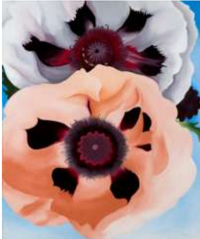
Georgia O'Keeffe (American, 1887–1986) Poppies, 1950 Oil on canvas 36 × 30 in. Milwaukee Art Museum, gift of Mrs. Harry Lynde Bradley M1977.133