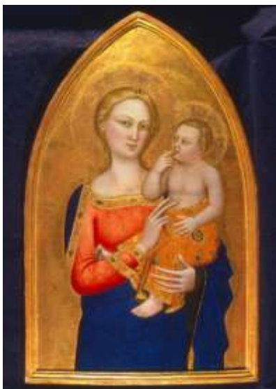
Nardo di Cione (Italian, ca. 1320–1365 or 1366) Madonna and Child , ca. 1350 Tempera and gold leaf on panel 29 1/2 × 19 in. Milwaukee Art Museum, purchase, M1995.679