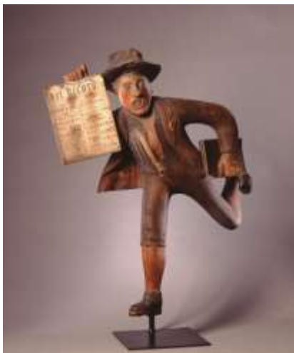
Unknown American Artist The Newsboy , 1888 Carved, assembled, and painted wood with folded tin 42 × 20 × 11 in The Michael and Julie Hall Collection of American Folk Art M1989.125