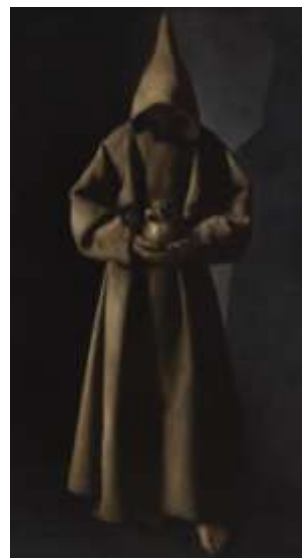
Francisco de Zurbarán (Spanish, 1598–1664) Saint Francis of Assisi in His Tomb , 1630/34 Oil on canvas 80 5/8 × 44 5/8 in. Milwaukee Art Museum, purchase M1958.70