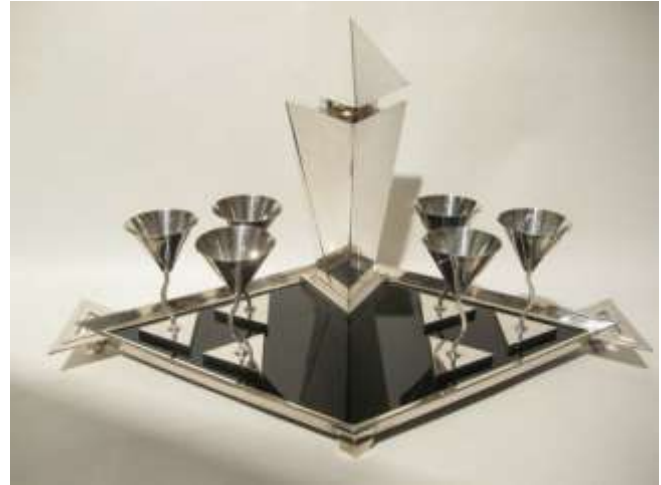
Elsa Tennhardt (American b. Germany, 1889–1980) Manufactured by E. and J. Bass Company (New York, ca. 1890–1930) Cocktail Set , ca. 1928 Silverplated brass and “Vitrolite” glass Milwaukee Art Museum, purchase, with funds from the Demmer Charitable Trust