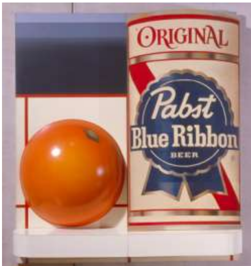
Tom Wesselmann (American, 1931–2004) Still Life #51 , 1964 Formica and commercially printed paper with plastic and acrylic on canvas 108 × 96 × 16 1/8 × 14 in. Milwaukee Art Museum, gift of Friends of Art M1970.10 Photo by John Nienhuis © Estate of Tom Wesselmann/Licensed by VAGA, New York, NY