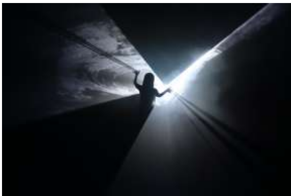
Anthony McCall You and I, Horizontal (II) , 2006 Computer, digital video, video projector, and haze machine, 33 min. cycle in six parts Milwaukee Art Museum, purchase, with funds from Contemporary Art Society, M2014.53