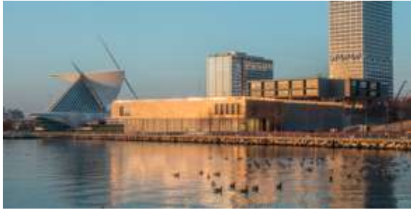
Herzfeld Center for Photography and Media Arts